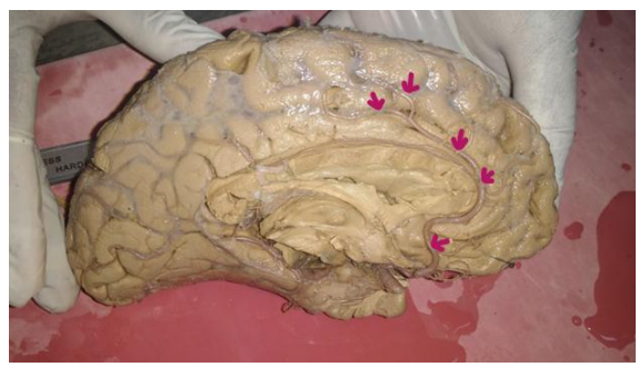
Figure 4: Branches of Anterior Cerebral artery

In the [Figure 3] on the right side anterior cerebral artery passes above the optic chiasma whereas on the left side anterior cerebral artery passes below the optic chiasma.